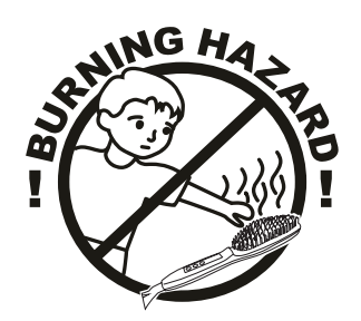
KEEP AWAY FROM CHILDREN